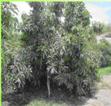
Avocado trees can grow up to 80 feet tall.