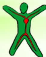
Healthy heart and blood